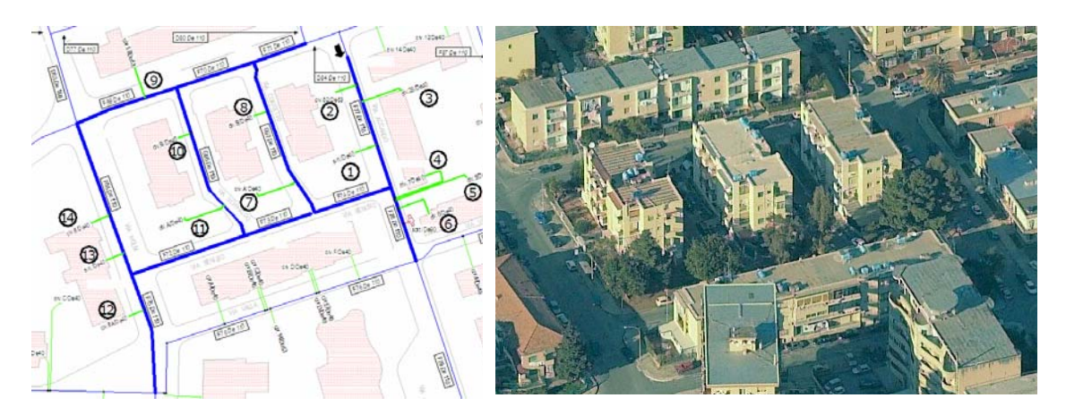
Figure 1.3 Map and view of the small District Metering Area (14 connections, 52 consumers)

Meters installed include 33 Class C turbine meters (age of meters up to 11 years), 17 Class B meters and 2 Class A meters (age of meters higher than 11 years). In addition almost all clients have storage tanks, making consumption at low flows a relevant part of total customer meter consumption.