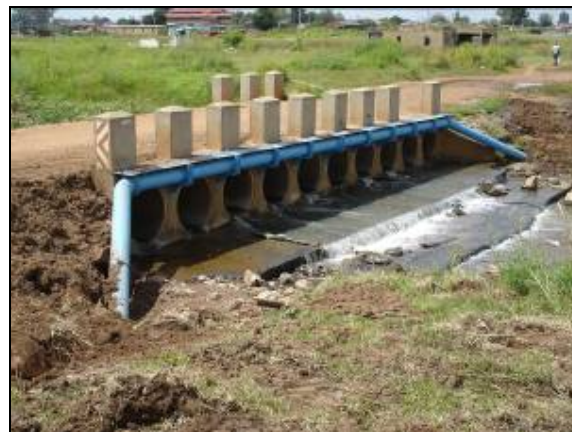
Figure 5: River crossing Completed