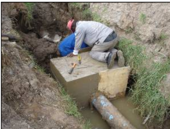
Figure 4: Thrust block to anchor pipeline

The municipality identified a 300mm river crossing in Small farms, which had been washed away on numerous occasions, as an urgent reticulation upgrade that was required. This is an example of several reticulation upgrades in the area to improve the level of service.