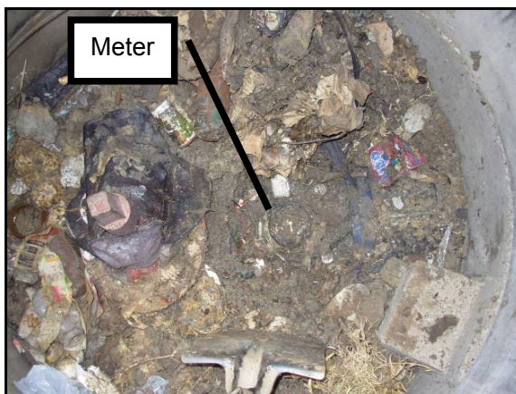
Figure 1: Dirty Meter Chamber