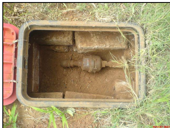
Figure 2 Cleaned meter box

The Water Services Assessors appointed to promote water use efficiency identified an additional 8170 leaks over a nine-month period just by visual inspection. Of the 8170 leaks reported, almost half were leaking taps and toilets inside the properties.