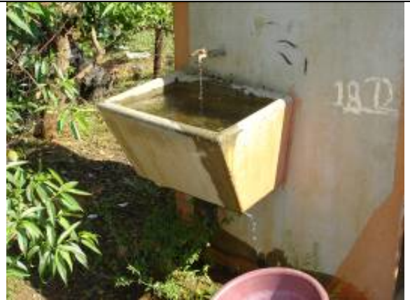
Figure 7: Tap running permanently

Because of the interventions, the average consumption reduced from 111m 3 /h to 80m 3 /h resulting in a savings of 31m 3 /h or 744m 3 /day. The Minimum Night Flow (MNF) was reduced from 94m 3 /h to 59m 3 /h.