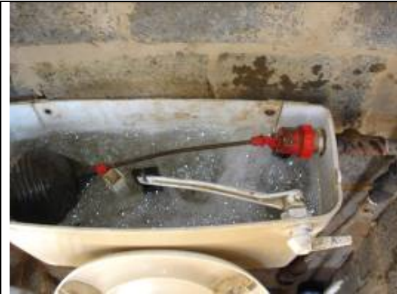
Figure 6: Cistern running permanently