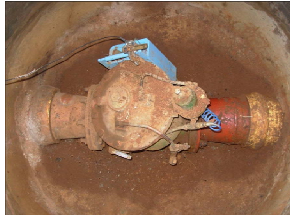
Figure 3: Pressure reducing valve installations prior to refurbishment

Training was provided to selected staff members on the operation and maintenance of control valves. The initial training was followed-up by hands-on training with the selected staff members by assisting them with the refurbishment of the valves.